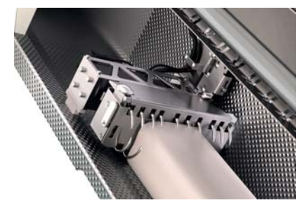
Product holder A650